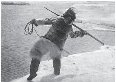
Nanook of the North , Robert Joseph Flaherty, 1922 (left and right)