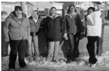
Still Image from Mohawk Girls

With insight, humor and compassion, the filmmaker provides an insider's look at life on the Kahnawake reserve, near Montreal. Portraits of three young Mohawk women at the threshold of adulthood reveal the challenges of growing up.